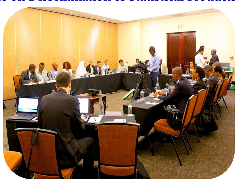
Communication and dissemination officers from 15 Africa National Statistics Offices (NSOs) in discussion during training workshop on Dissemination of statistical products held in Pretoria, South Africa. The four-day workshop was organized by the African Union under the Pan African Statistical Programme (PAS).

The participants pointed out that dissemination policies must ensure official statistics – as a public good – are easily accessible to all stakeholders including ordinary citizens. Furthermore, they advised that to make the results understood-